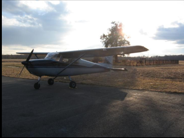
1. Beautiful picture of Jeff Test's C-172 at the Tappahannock Airport looking west over the cemetery